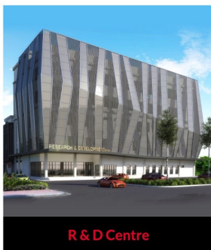
R & D Centre